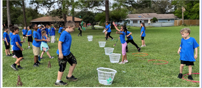
Our 1st and 2nd graders participated in Field Day at Fred Lee Park on 3/10/22.