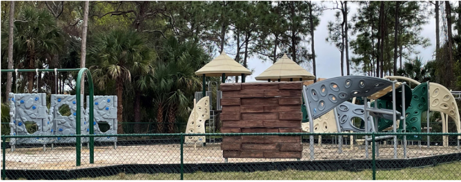
We are excited to have added some additional climbers to our early grades playground. Our new intermediate grades playground is almost complete! We are waiting for some additional mulch and an inspection and cannot wait to have students enjoying their new play space.