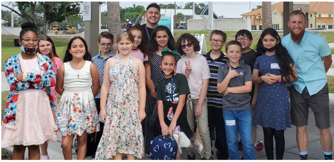
15 students represented Odyssey on March 10 at the Science & Engineering Fair.