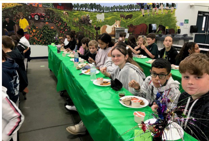
We were thrilled to celebrate over 200 3rd-5th grade students at our annual Honors Breakfast in February.