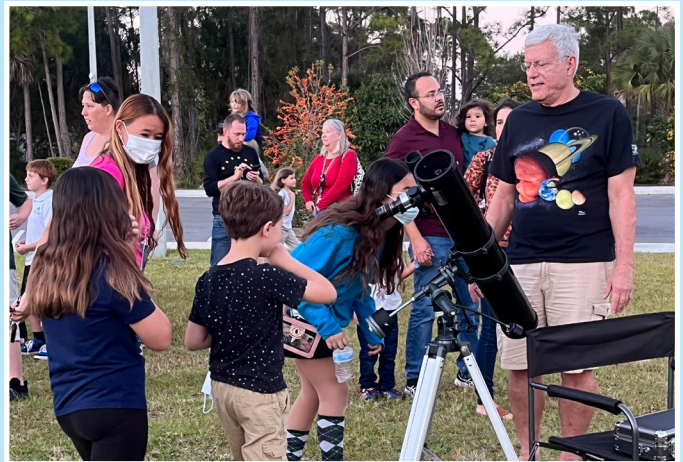
Families of 1st and 5th grade students joined together with the Brevard Astronomical Society for a Star Party as they learned about the planets, stars & constellations in our solar system.