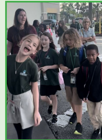
10/4 we enjoyed some fresh air and got our steps in during our annual walk to school day event, welcoming students, families, and staff to walk to school