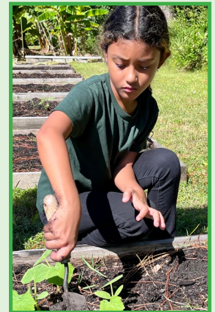
9/20 students are preparing the gardens, planting seeds, weeding, and tending the garden