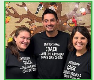
Odyssey's Instructional Coaches