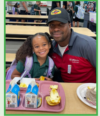
9/15 and 9/22 we welcomed our Dads to our annual Dad's Take Your Child to School Breakfasts