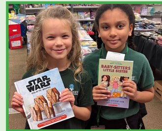
9/27 – 10/6 our fall Scholastic Book Fair "Odyssey Loves to Read a Latte" was a huge success